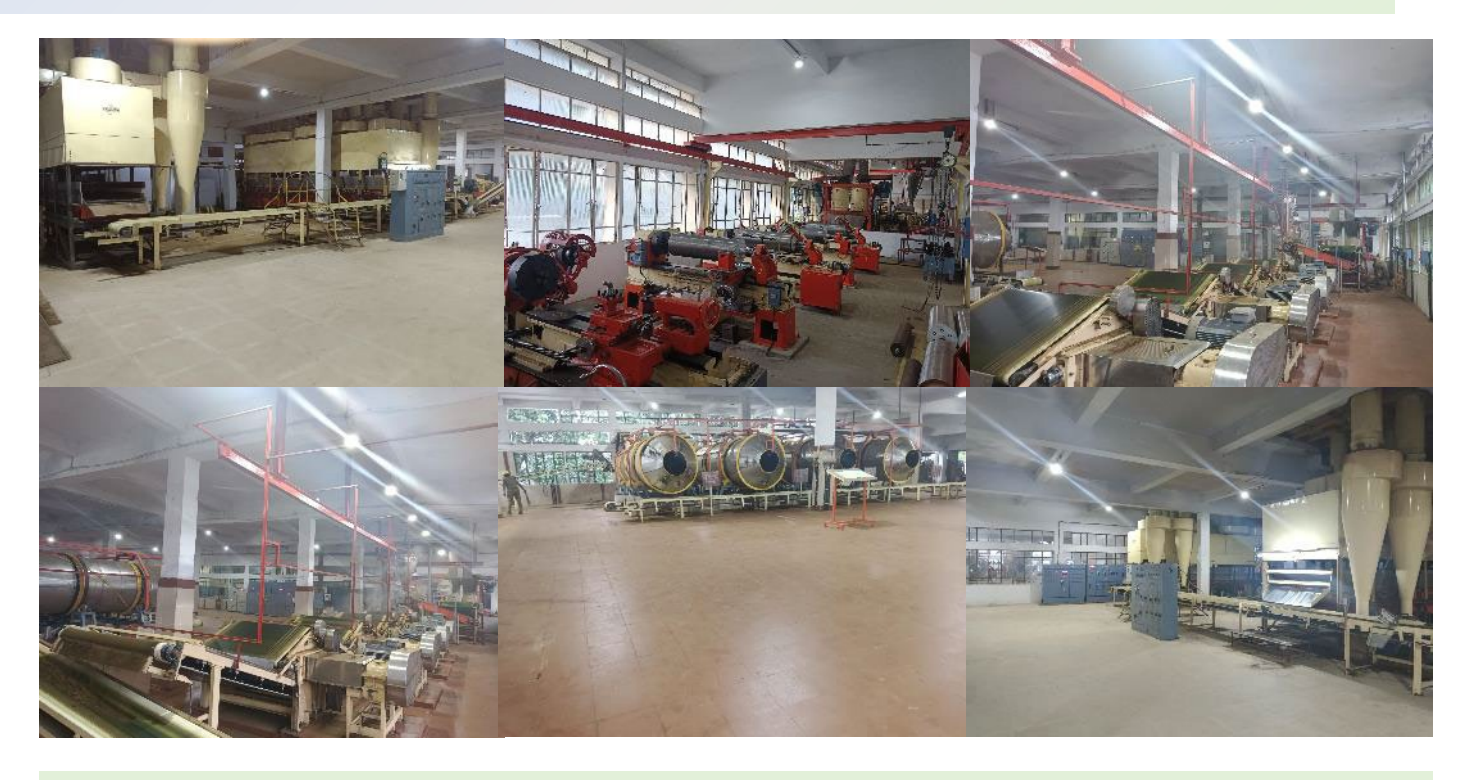
Modernization of the Tea factories for future readiness