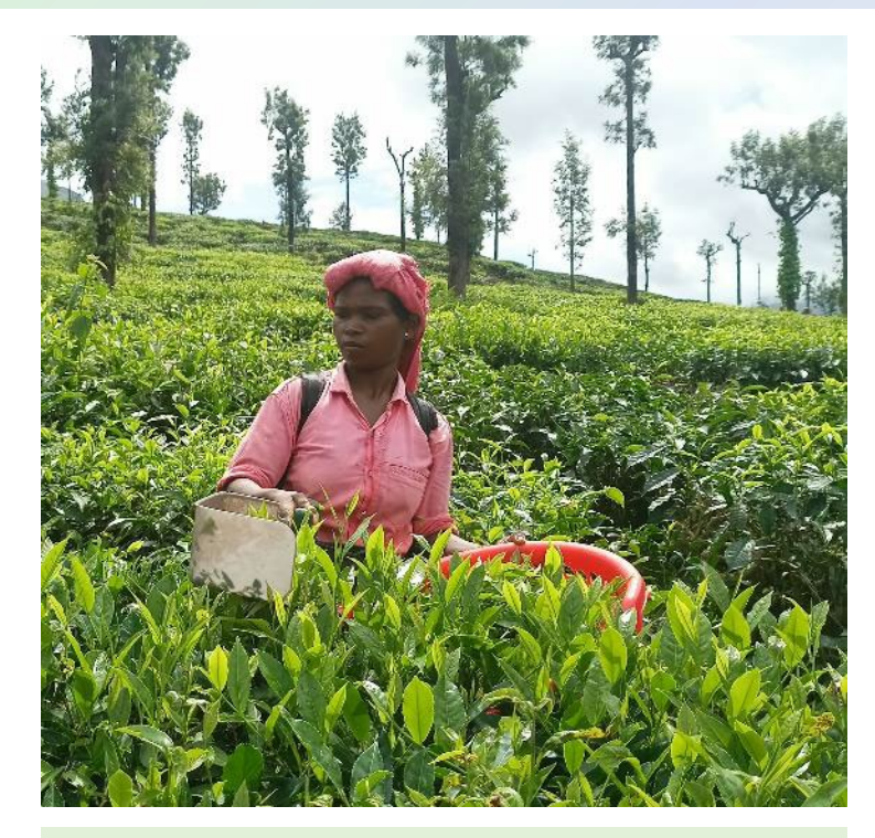
Use of Battery-operated shear – improved plucking average, reduced wastage of leaf, better standard of plucking resulting in better tea